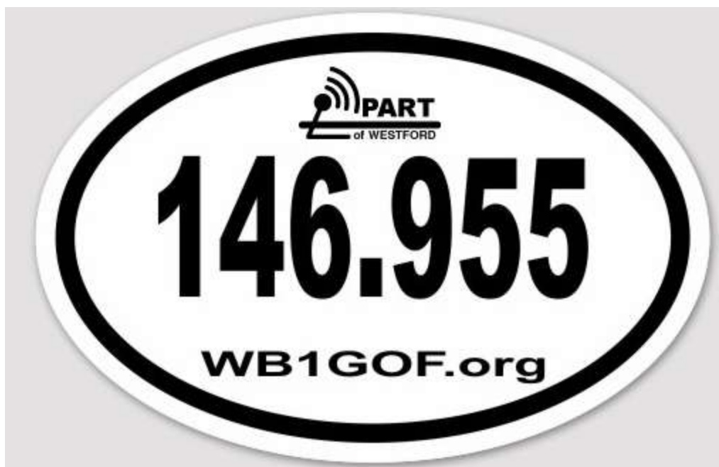
PART window/bumper stickers available at PART meetings and events